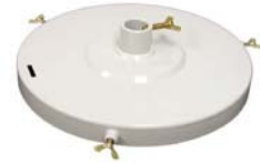
Drum Cover # 65385