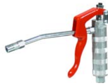
Control Handle # 1536A