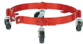
Drum Dolly # 120-S