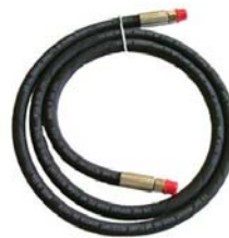
High pressure grease hoses