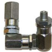
"Z" Swivel # 1545