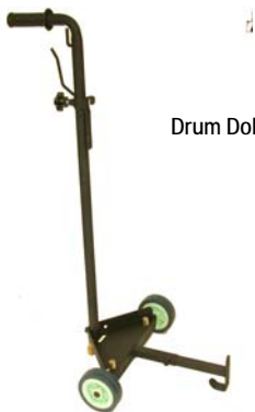
Drum Dolly # 147