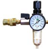
Filter & Regulator unit # 1559A-ASSY